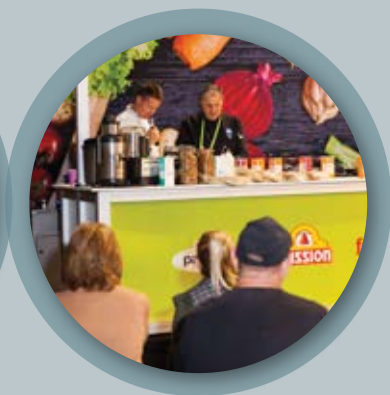
Café School Workshops to take your business to the next level