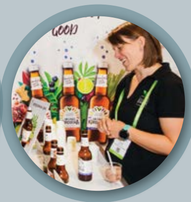
Speciality Producers Boutique food and drink from around Australia