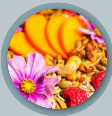
Food, Drink and Equipment New ideas and products from over 400 exhibitors

Discover new ideas for your café, restaurant, commercial kitchen or foodstore at Foodservice Australia. This year's show is moving to the Melbourne Exhibition Centre and will be bigger than ever. Be inspired and boost your bottom line.