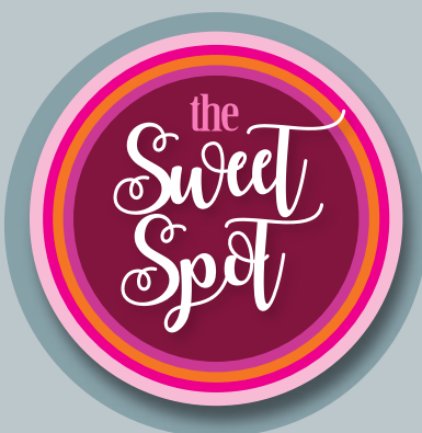
The Sweet Spot All new stage showcasing all things sweet