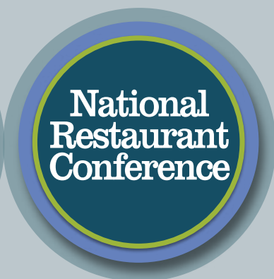
Restaurant Conference Be informed, educated and inspired