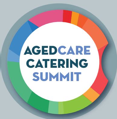
Aged Care Catering Summit Learn about the changing face of aged care