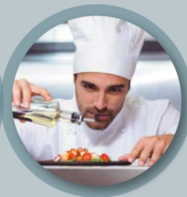
Chef of the Year Live cooking action on the show floor